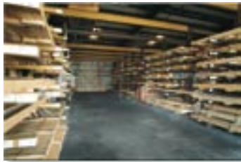
TOP: Part of the warehouse where raw material is stored before being sent to manufacturing for conversion to parts.