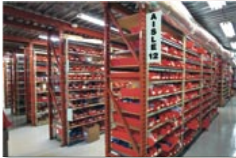
BELOW: Part of the extensive warehousing and shipping department.